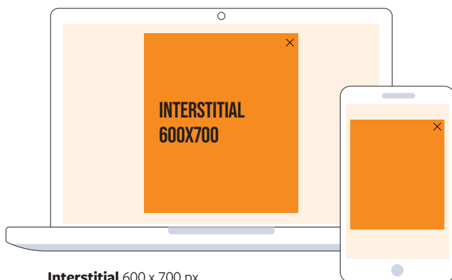
Interstitial 600 x 700 px